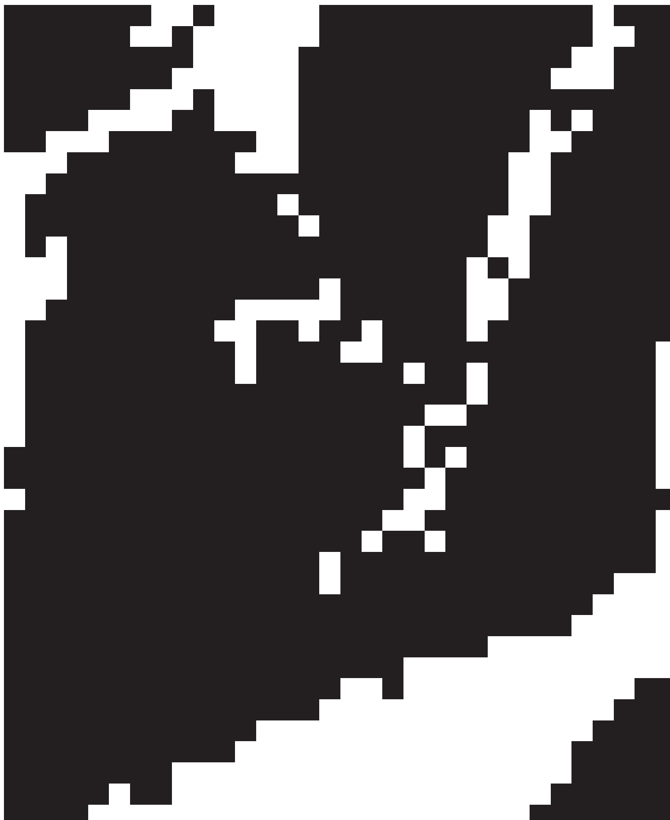
Pattern illustration 1:1