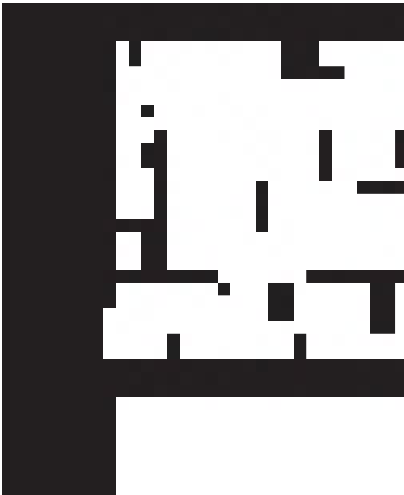
Pattern illustration 1:1